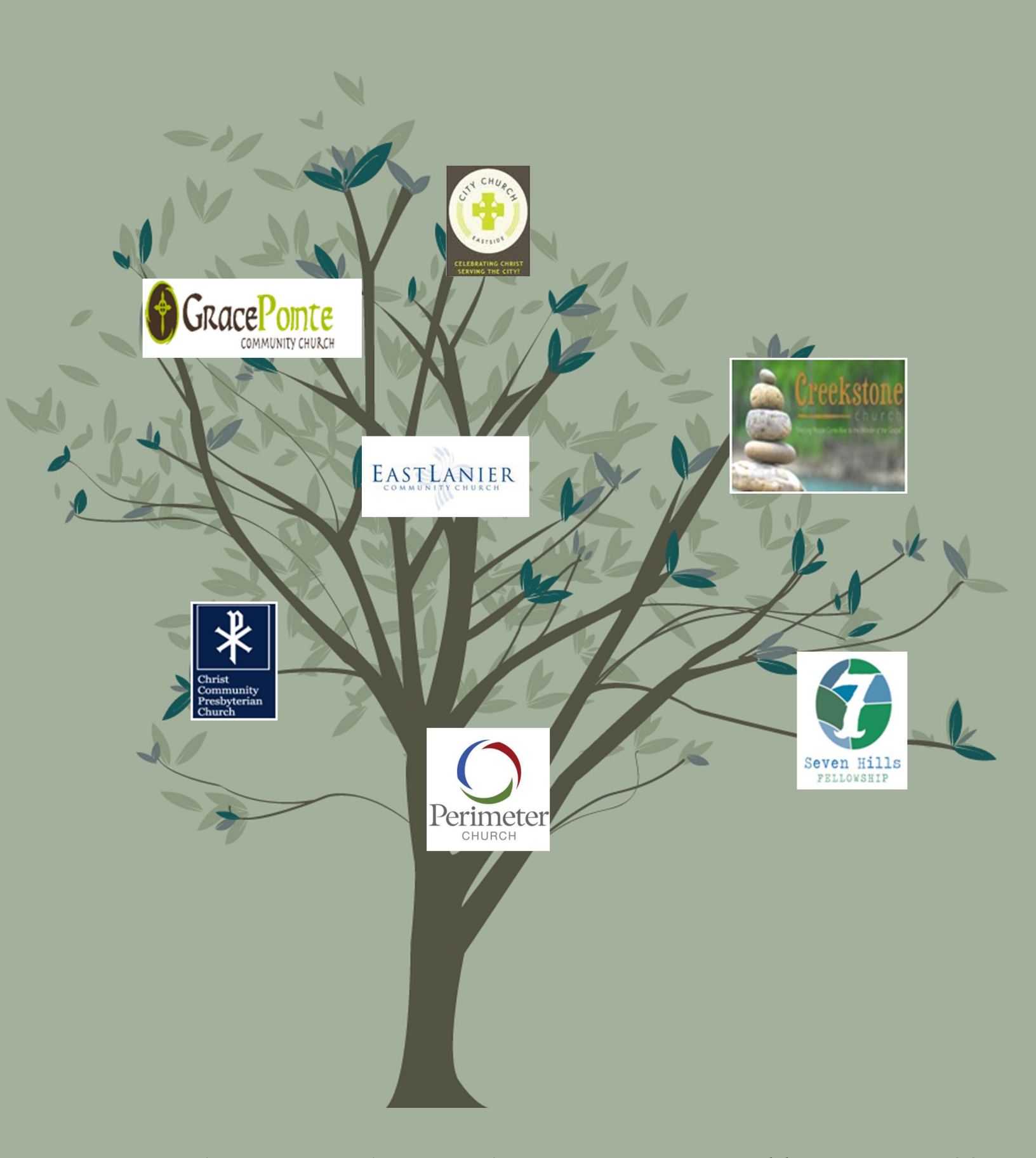
Church Planting "Tree"